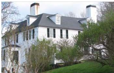
The Sayward-Wheeler House, built in 1718, is one of the many historical...

STAY The York Harbor Inn (Route 1A, York Harbor, 207-363-5119 or 800-343-3869, www.yorkharborinn.com , $149-$349, with breakfast) is an accommodating country inn with a dining room and tavern. Gardens and woodlands surround Morning Glory Inn (120 Seabury Road, York Harbor, 207-363-2062, www.morninggloryinnmaine.com , $155-$235 with breakfast), a secluded, boutique bed-and-breakfast catering to romantics. The 1889 Chapman Cottage (370 York St., York Harbor, 207-363-2059 or 877-363-2059, www.chapmancottagebandb.com , $175-$225 with breakfast) is a plush B&B. Inviting Adirondack-style chairs accent the harbor-front lawn at Edwards' Harborside Inn (7 Stage Neck Road, York Harbor, 207-363-3037 or 800-273-2686, www.edwardsharborside.com , $170-$300 with breakfast). For less expensive digs, check into Katahdin Inn (11 Ocean Ave., York Beach, 207-363-1824, www.thekatahdininn.com , $65-$145), a comfy guesthouse overlooking Short Sands Beach. The Candleshop Inn (44 Freeman St., York Beach, 207-363-4087 or 888-363-4087, www.candleshopinn.com , $105-$195, with breakfast) is a vegetarian B&B and holistic retreat center near Short Sands Beach. The pet-friendly Country View Motel & Guesthouse (1521 Route 1, 800-258-6598, www.countryviewmotel.com , $85-$250) has accommodations ranging from standard rooms to townhouses.